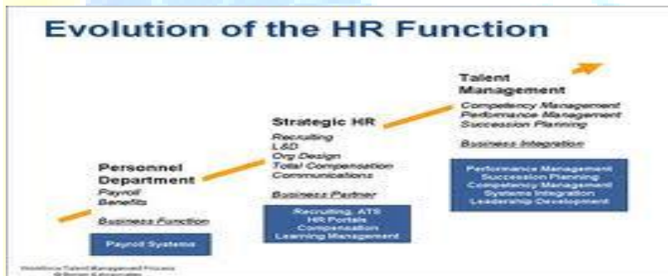
Fig. 103: https://www.google.co.in/search

The business world, however, has been changing faster than ever, with significant shifts in scope and character. Organizations are learning to deal with disruptive technology, shifts in economic power, talent mobility and black swan phenomena. Naturally therefore, while HR has been busy transforming itself from the tactical to strategic, modern organization require Human Resource to play a key business role, not as a partners but as a significant contributors to the integration process.(5)