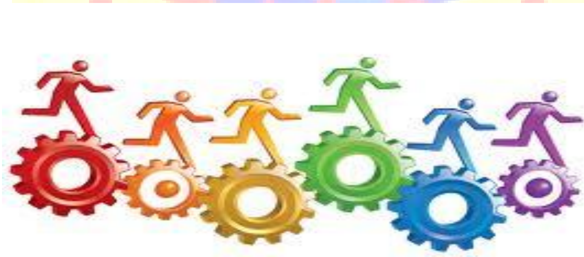
Fig .102: https://www.google.co.in/search