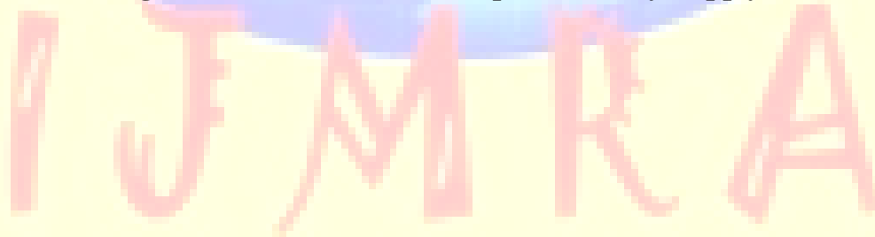
Figure 4: Cumulative IRF, impulse=Money Supply