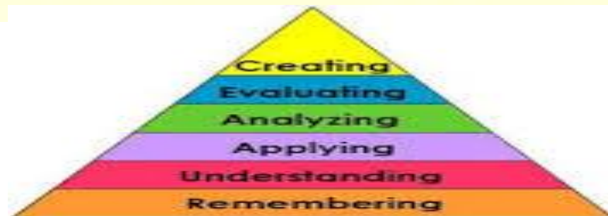
Figure 1: Bloom categorized the human thinking abilities, ( https://ar.wikipedia.org/wiki , 2014)

The critical thinking abilities are nested within the upper three levels of Bloom's taxonomy- analyzing; evaluating, and creating. Therefore to advance to the critical thinking ability, it is necessary to master the lower three levels of Bloom's Taxonomy- recalling, understanding, and creating.