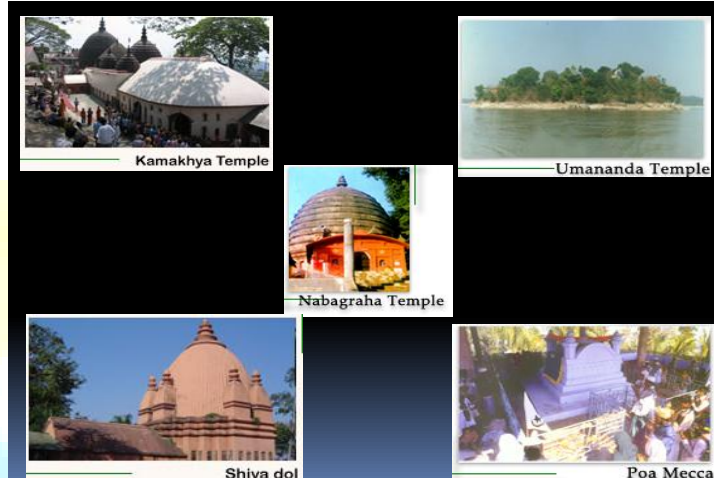
Fig-4 Holy Shrines of Assam

came into existence without manmade effort and again there are such temples which reflect the architectural skill of the creative minds and artistic hands of the people residing here. These shrines can attract both domestic as well as international tourist. They are the Sukreshwara Temple, Kamakhya and Bhubaneswar Temple, Navagraha Temple, Umananda Temple, Poa Mecca, Satras of Majuli, etc.