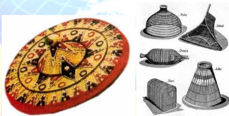
Fig-3 Art and Crafts of Assam

Cane and bamboo products like dhara (mats), Khorahi (small basket), Jaapi (headwear) etc. form the backbone of Assam handicrafts and are most sought items both in the domestic as well as in the global market. The replica of the world famous Kamakhya Temple and the figure of the one horned rhino are the two most important woodcraft items of Assam, which are highly demanded by the visitors. Brass and bell metal products such as xorai, bota, kahibati etc. form the important metal crafts of Assam, which are known for their beauty, strength and usefulness. Handloom weaving is the identity of Assamese women. They are expert weavers of a variety of handloom garments like woolen shawls, gamochas (towels woven in cloth), and the unique and graceful mekhela-chadar (the traditional dress worn by Assamese women) made of paat and golden colored Muga-silk. In addition the Arts and Crafts of Assam also include masks used in Bhaonas, toys, ivory products, etc.