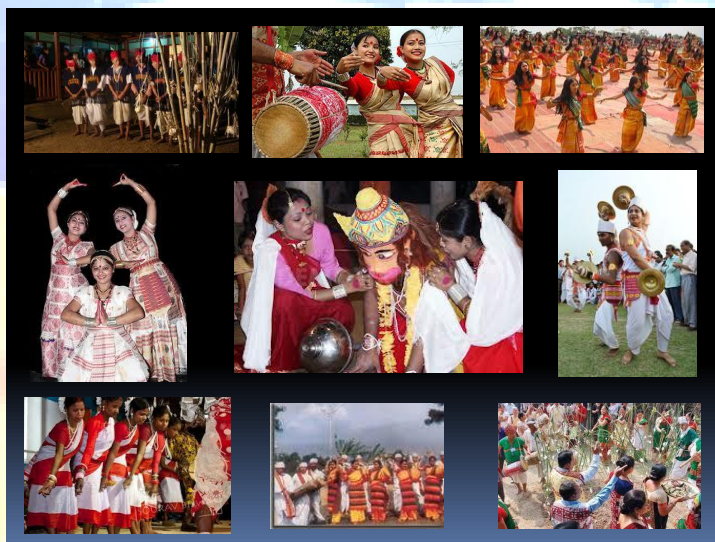
Fig-2 Folk dances of Assam

The folk dance and music of Assam are also as rich and colorful as Assam itself. The vibrant steps, colorful attires and wonderful music used while performing the folk dances of Assam creates a magical ambience. Satriya dance has achieved international repute. Certain dances have religious significance while others are performed for mere entertainment. Some of the folk dances of Assam are Bihu, Satriya, Ojapali, Deodhani, Bagarumba, Baishagu, Gumrag, Kherai, Bayukh, Jhumur, Haacha Kekaan and Chomangkan.