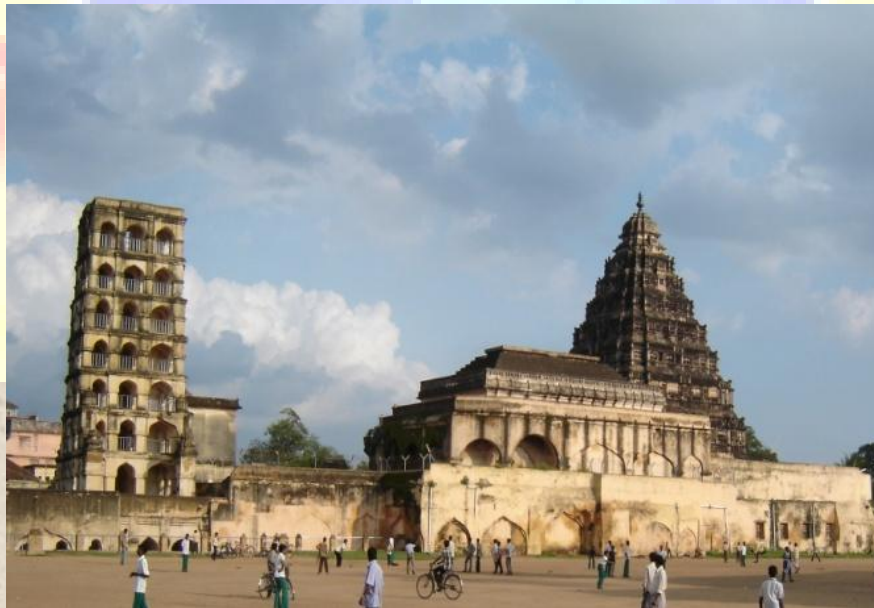
Figure 3: Bell Tower and Arsenal Tower of Palace complex

The palace complex consists of many important buildings of Nayaks and Marattas. Bell tower, Arsenal Tower, Sangeeth Mahal, Darbar Hall and Sarja Madi are the important buildings of the palace complex. Bell Tower is a high rise structure of 32.36 m height, which was used for defence purpose as information transmission tower. Arsenal Tower is the most architecturally rich and attractive building in the entire palace complex. It is of pyramidal shape and has a height of 43.6 m. This tower was built as a pleasure resort for the royal family, by Nayak rulers. Later this building was used for storing ammunitions during war time in British period. Bell tower and Arsenal tower in Palace complex create a varied skyline in the historic core of Thanjavur. (refer fig.3). Sangeeth Mahal is used as an audience hall, where dance and music activities were performed. The royal family used this hall to view the performance and to enjoy the concerts with all comforts in privacy. The Darbar Hall is beautifully decorated with fresco paintings in the walls and ceilings. Darbar hall was used as an official meeting place during the Maratta Period. Sarja Madi is in the eastern part of the palace complex, built in the indo-saracenic style. It is a six storied structure, known for its architecturally rich projecting balconies [Gopalakrishnan and Pushplatha 2007].