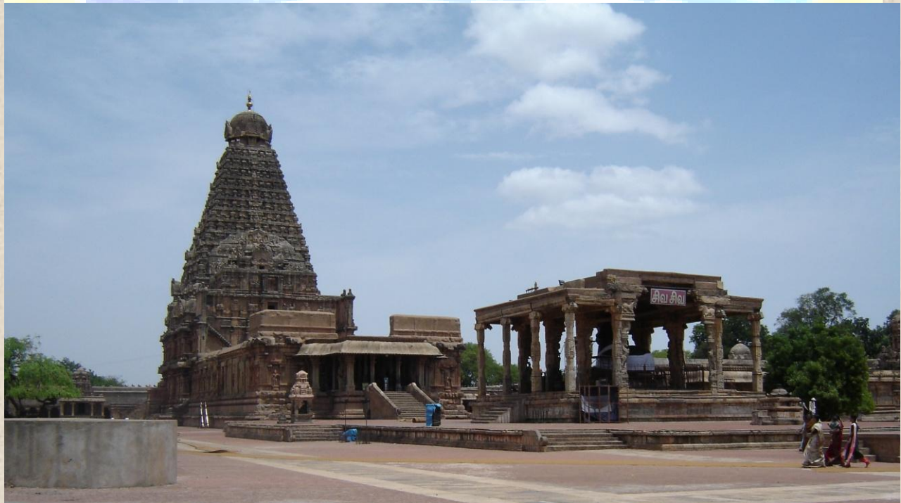
Figure 2: Brahadeeswara Temple, Thanjavur

The great Chola King, Rajarajan (985-1014 A.D.) built Rajareswaram - the Brahadeeswara temple (refer fig.2) at Thanjavur, which according to experts, is a standing classical monument of the Chola style of art and architecture. The temple is constructed of granite, mostly of large blocks, a rock that is not available in the neighbourhood and had therefore to be brought from a distance, that itself a colossal task. The plinth of the Central Shrine is 45.72 sq.m., the shrine proper 30.48 sq.m. and the vimana 60.96 m. high. On the massive plinth, covered throughout with inscriptions, there are niches on three sides in two rows, containing representations of deities such as Siva, Vishnu and Durga. Temple of grand design and majestic proportion, embellished with the works of skilled sculptors, are the visible manifestations of the spirit and culture, priorities and principles, cherished values and beliefs of the people who lived in those days. The vimana of Brahadeswara Temple acts as a visual landmark as well as a city icon. In 1987 UNESCO & Government of India has declared this temple as a World Heritage Monument [Pichard, P. 1995; Gopalakrishnan, P. 2006].